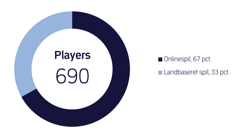
Figure 3. Distribution of the players' problem games (Online and land based)

The Danish Gambling Authority also ask players about their primary and secondary problem games. In total, 690 players and relatives provided this information. The figures show that 67 per cent state online gambling activities as their primary or secondary problem game. The remaining 33 per cent stated land-based games, e.g. gaming machines, betting in kiosks and land-based casinos, cf. figure 3 .